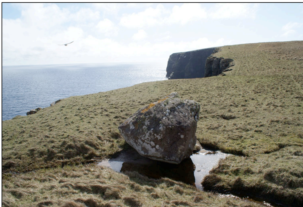
Figure 3 – The Gore's Kirning Stane

Despite the fact that the gýgr has changed sex, this story is an authentic survival of Norse tradition. It is the only example found from Shetland where the gýgr (or Guir) was remembered as a gigantic supernatural being into the late 20th Century.