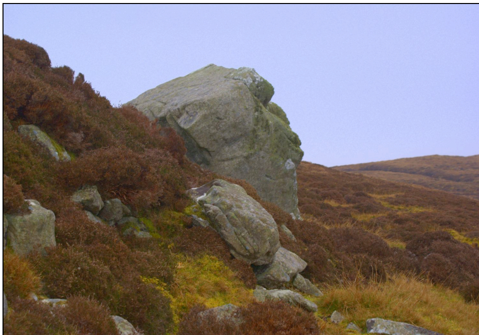
Figure 2: Goorn on Fair Isle (author's photograph)